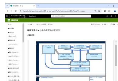
Portal site for environmental information for employees