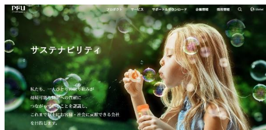
"Sustainability" Page on Our Official Website

In addition, we have built an environment to distribute information within the company to raise awareness of SDGs among workers in the PFU group.