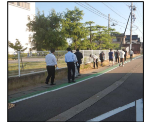
Commute route cleanup (Headquarters)

At PFU IT Services Limited, we participated in cleanup activities around our business sites located in Miyagi, Kagawa, Fukui, Saga, and Kanagawa Prefectures. We remain committed to actively engaging in local events and contributing to environmental initiatives.