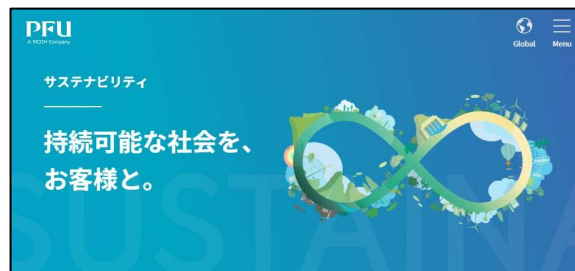
"Sustainability" Page on Our Official Website

In addition, we have built an environment to distribute information within the company to raise awareness of SDGs among workers in the PFU group.